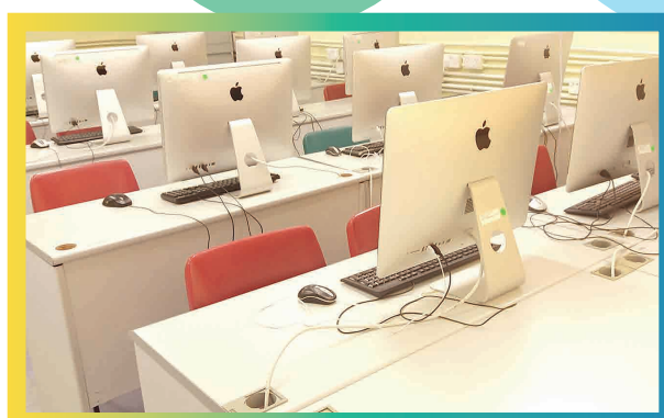
電腦室 Computer Room