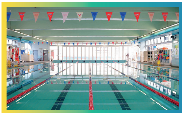
游泳池 Swimming Pool